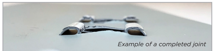
Example of a completed joint

The strength of each joint depends upon the gauge and properties of the metal being connected. As a general rule, 20 punches on each side of .4mm soft iron sheets provide a tensile force of approximately 25kN (5620 lbf).